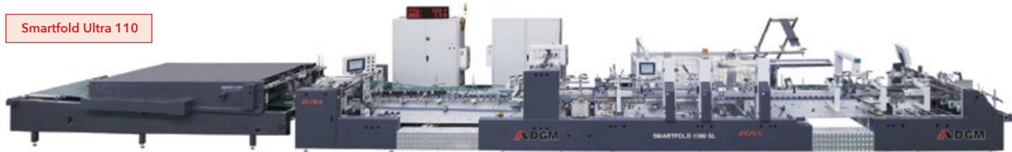
Smartfold Ultra 110