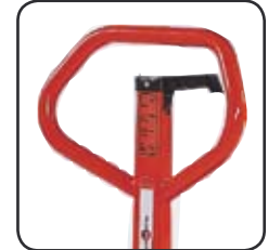
Ergonomic handle ensures the user a relaxed hold. The handle can be marked with the name/department.

Available with manual and electric lifting.