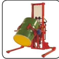
Available with side-tilting forks and/or optional extras, e.g. drum turner, remote control, level control, crane arm.