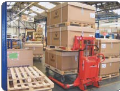
Strong construction ensures a long operating life and low maintenance costs.

We also offer tailor-made solutions. Please ask for further information or visit www.interthor.com