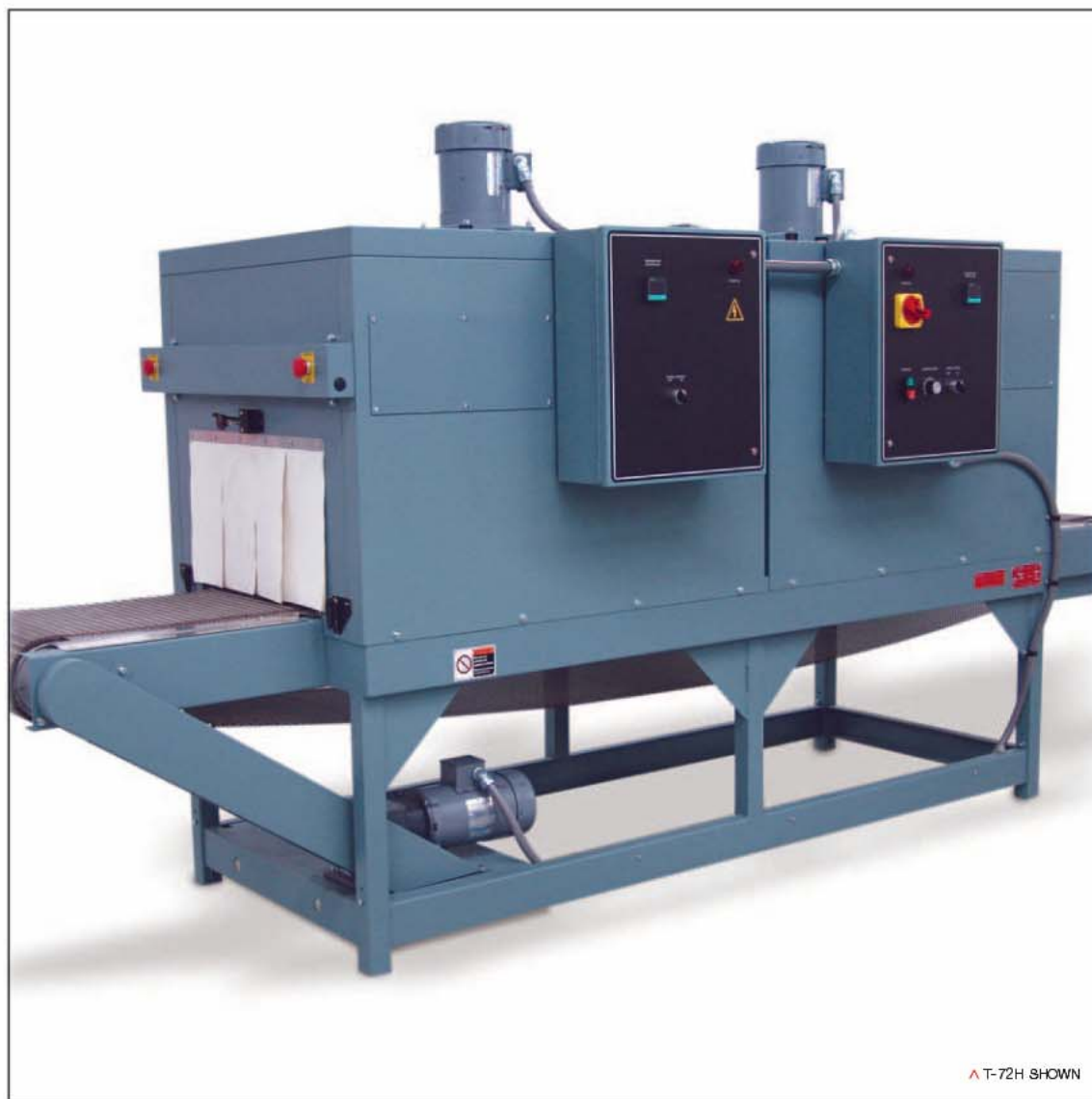
▲ T-72H SHOWN

Flexible, Dependable, and Ready to Take On Your Toughest Challenges