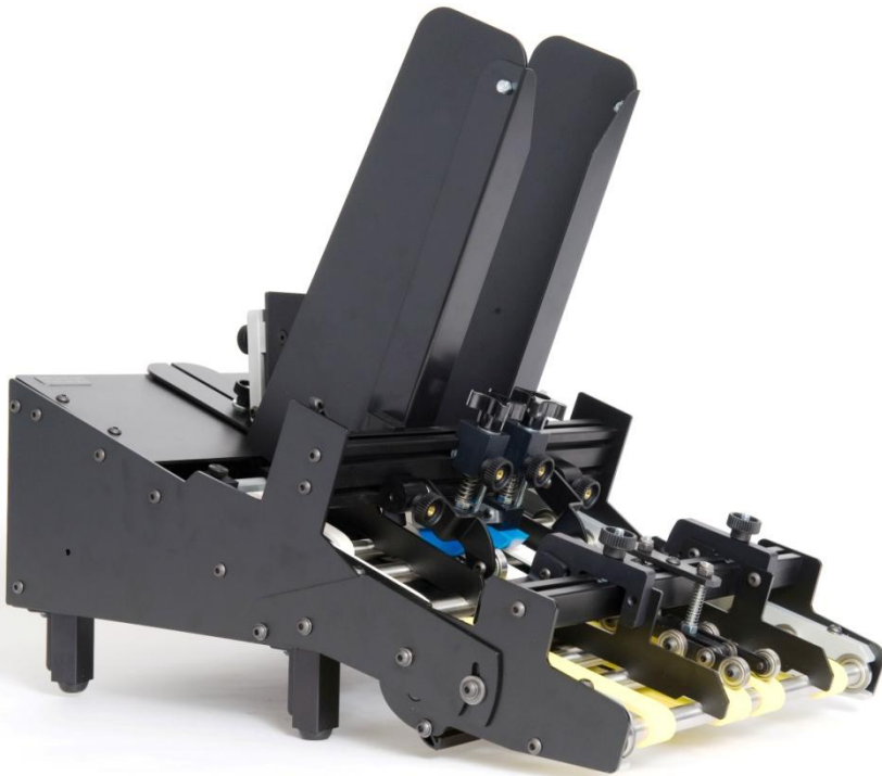
D-12 Demand Feeder

Our D-12 and D-20 line of friction feeders are the solution to your single shot AND continuous feed applications!