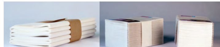
Examples for product stacks from the delta-pro