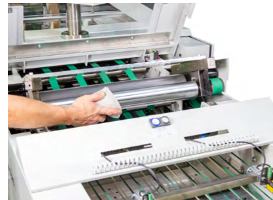
Easily accessible pressing unit of the delta-pro