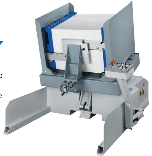
model SWH 125 RLA

The new SPEEDTURNER® generation brings the pile treatment to perfection - associated with increased ease of use and an appealing design.