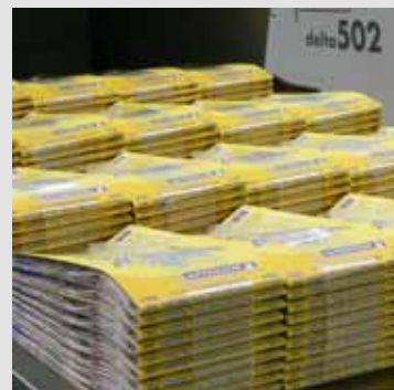
■ Neatly stacked maps banded with LDPE film