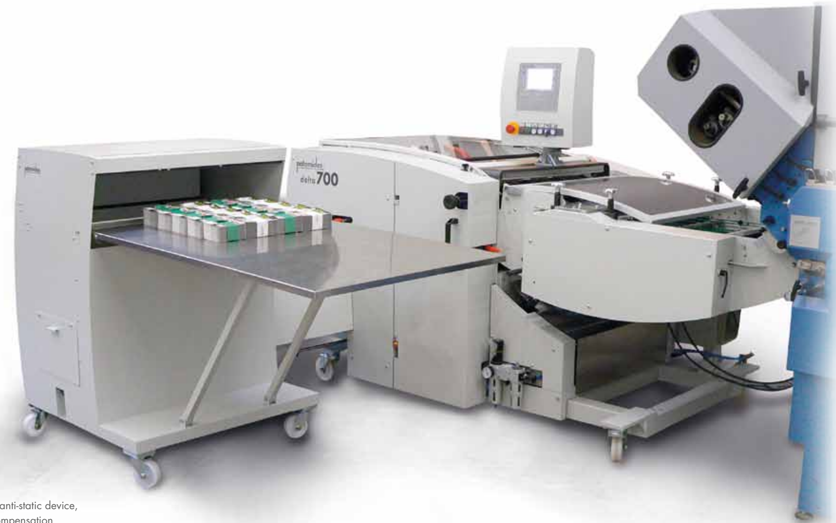
delta703 Automatic Delivery with anti-static device, small format-device and stacking level compensation

With the new automatic delta delivery the focus is on higher productivity with lower personnel costs. Sturdy, easy-to-handle stacks ensure effective removal to subsequent processing machines.