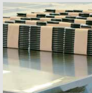
■ Small format brochures from the saddle stitcher