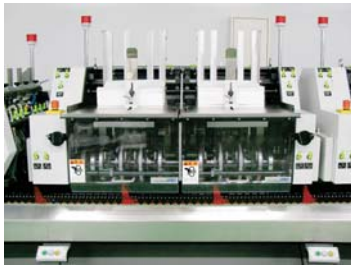
ORF-122 Duplex rotary feeder (two pockets/feeder)