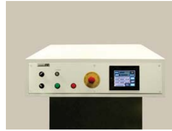
ORS-713 Saddle stitcher 5" control panel