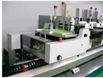
ORC-315 Folder feeder