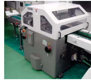
OT-352 3-Knife Trimmer