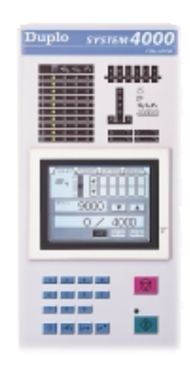
Touch-screen, keypad and LED display

Detectors automatically sense when a bin has been loaded and enable all the functions of that particular bin. A touch screen, key pad and LED display keep the operator informed of the system's running status at all times. Other production-enhancing benefits include self-setting misfeed and double-feed detectors to make sure output is complete and accurate. Moreover, the System 4000 uses an advanced infrared light detection system to provide constant and highly accurate monitoring.