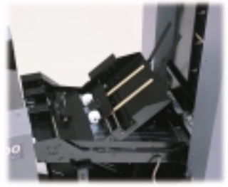
Hand-marry, off-line feeding and reject stations

The unique vacuum feed on the System 4000 is designed to handle a wide variety of paper stocks with complete accuracy at high speed. This superior feeding system allows air and vacuum to be delivered independently to each bin by individual systems located at the bins. Whether two bins or 60 bins are used, the right amounts of air and vacuum are applied. This ensures accuracy, efficient operation and optimum productivity at all times.