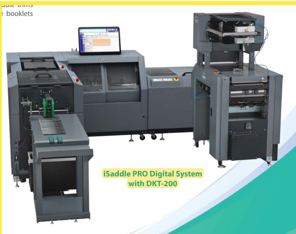
iSaddle PRO Digital System with DKT-200