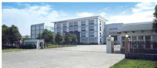
Brausse Group's State of the Art Manufacturing Facility in Shanghai, China.