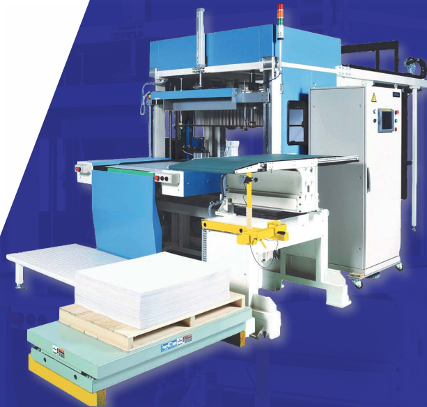
Master Blanker BLK