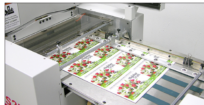
The full length alignment table with micro side-to-side and skew adjustment ensures very accurate paper alignment.