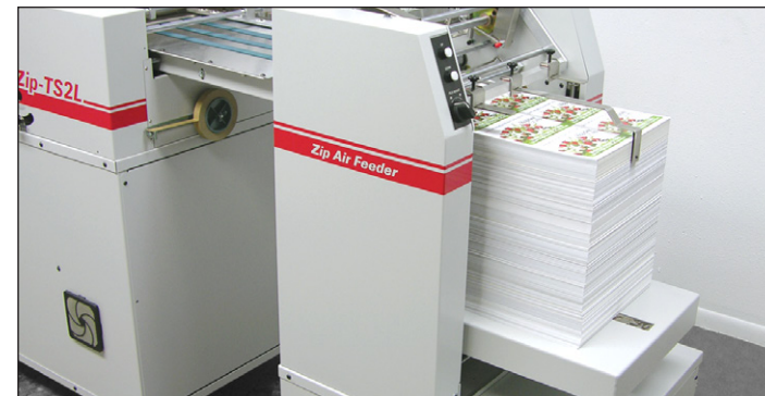
The offset style suction feeder can hold up to 13.5" of paper.