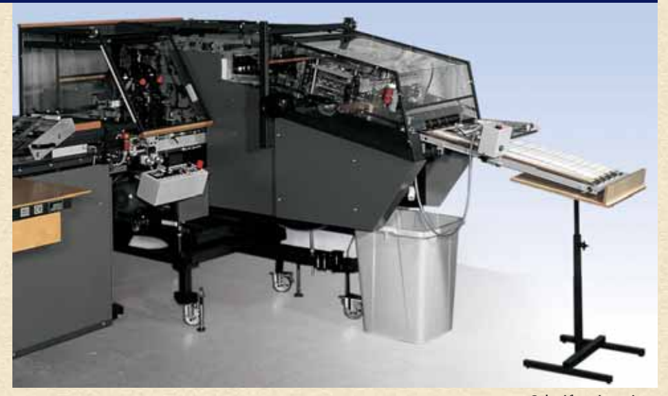
3 knife trimming.

Fibre optics ensure exact alignment of punched products with the highest degree of accuracy.