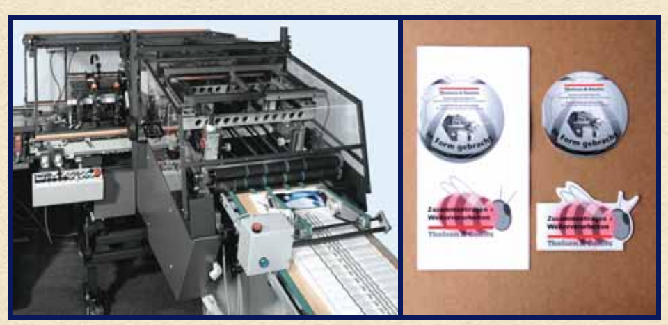
Former punched booklets.

Is a powerful addition to the stitch/fold/trim line to enable multiple production giving an output as high as 12,000 books per hour.